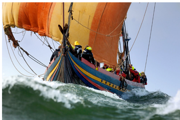
The Sea Stallion crossing the North Sea.

Follow the final stages of the Sea Stallion 's voyage home to Roskilde at www.havhingsten.dk .